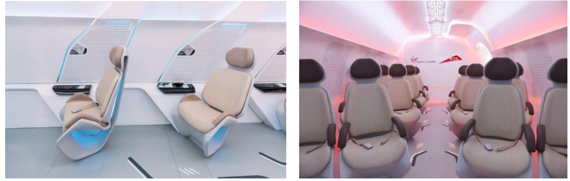
Figure 1. An example of a Virgin Hyperloop One pod interior that was unveiled in partnership with the Roads and Transport Authority in Dubai.

A Virgin Hyperloop One pod is similar to a large bus or a small aircraft that seats 10-30 passengers. A comfortable interior with plush seating, soothing lighting, and access to entertainment and media are all possible interior configurations of the pod.