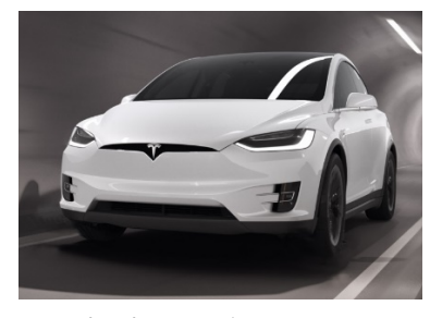
Standard-Capacity AEV (Tesla Model X)