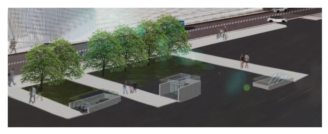
Figure 2 – Conceptual Rendering of the Surface Footprint of a Subsurface Station