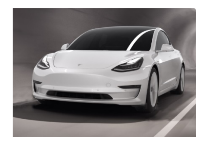
Standard-Capacity AEV (Tesla Model 3)